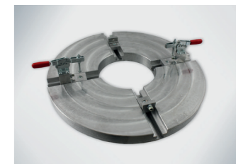
Welding neck support