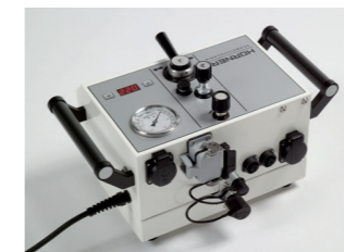
All connections at the back panel of the hydraulic unit