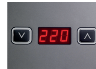
Centralized temperature control

All components are covered by the HÜRNER warranty.